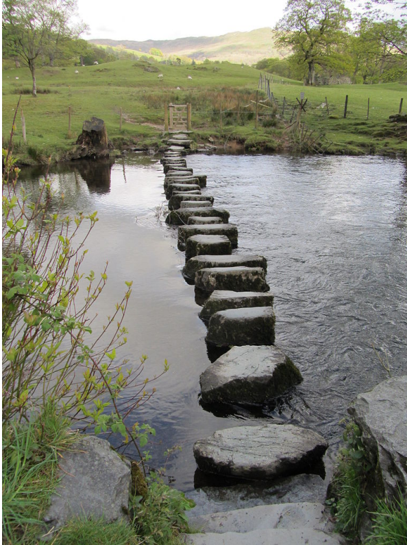
Stepping Stones over River Rothay, Strobilomyces