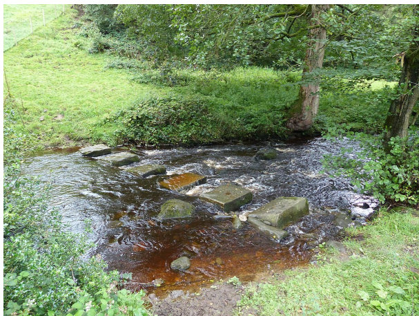
Stepping Stones across Kex Beck, Kognos